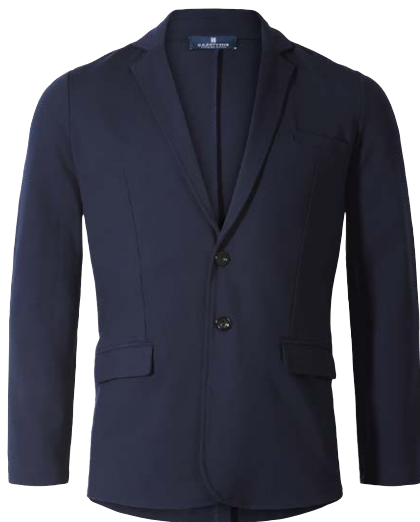
50185 (4350) – MEN'S BLAZER Sizes: XS-3XL (46-58) · Meas.: M8