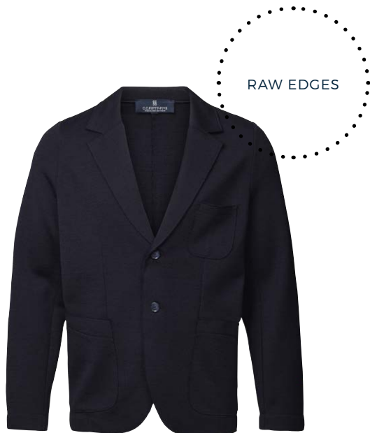
50187 (4651) – MEN'S BLAZER Sizes: S-3XL (48-58) · Meas.: M12