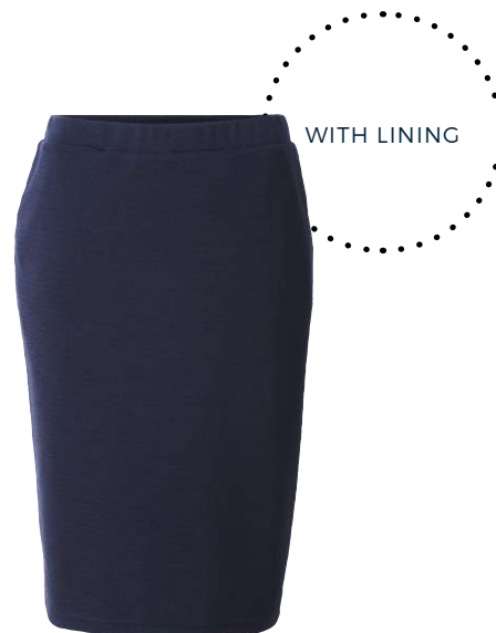
50189 (4656) – WOMEN'S SKIRT Sizes: XS-4XL · Meas.: W12