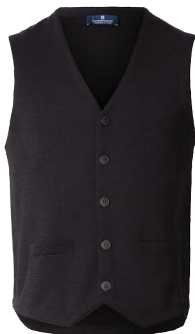
50190 (4659) – MEN'S WAISTCOAT Sizes: XS-3XL (46-58) · Meas.: M15