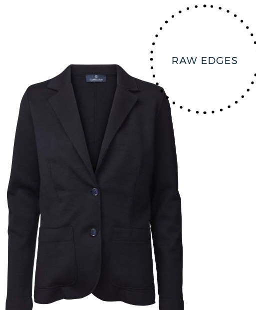
50186 (4650) – WOMEN'S BLAZER Sizes: XS-4XL · Meas.: W3