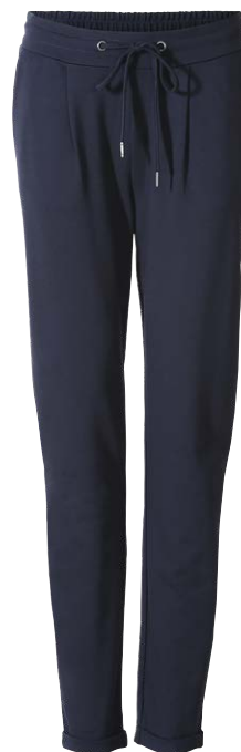
50184 (4302) – WOMEN'S PANTS Sizes: XS-4XL · Meas.: W11