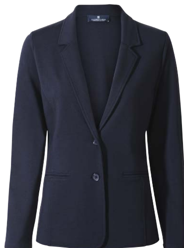
50182 (4300) – WOMEN'S BLAZER Sizes: XS-4XL · Meas.: W6