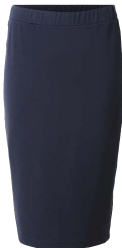
50183 (4301) – WOMEN'S SKIRT Sizes: XS-4XL · Meas.: W12